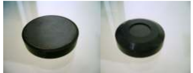
Magnet upside; downside; black silicon damper