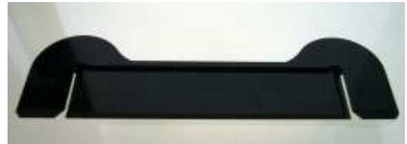
Black acrylic foot