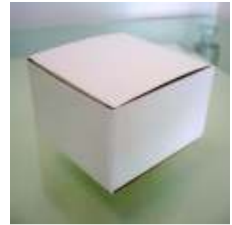
The standard box 15 x 15 x 10